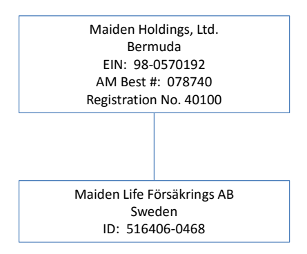
Diagram 1: Company position within Group Structure

The position of the Company within the Group as at 31 December 2017 is as shown in the diagram below: